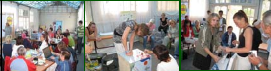
Work of conference, presentation of co-ordinators and teachers, exchange of experience